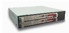
Cardnest CN4 / 4 slots

All CN4 systems are designed to be directly powered at -48 Vdc. In this case no additional power module is required (no CN4 power slots are used). -48 Vdc is directly routed to each card in the system. When the Cardnest CN4 of the Desktop CN4/4 slots is powered at 230/115 Vac, one or two 230/115 Vac power modules may be inserted in the available power slots. These power modules can work in full power redundancy and allow hot swapping in case of power problems.