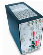
Cardnest CN4 / 2 slots